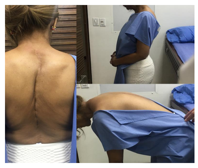
FIG. 4. Healed surgical wound (left). Independent stand up position (upper right). Adequate mobility (lower right).

Our patient showed satisfactory functional outcome (FIG. 4). Radiotherapy has been established as a successful treatment and different protocols have been used in individual cases, to avoid transformation to multiple myeloma, which occurs in 50% of the cases within 5 years [10,11]. Plasmocytoma have a significantly higher 5-year survival rate compared to multiple myeloma, which is 75% vs 32%, respectively [13,14]. Knobel et al. [15] demonstrated that, in solitary tumors less than 5 cm in size, local control was attained with moderate dose radiation at a rate of 91%; and 73% in those >5 cm. Extradural Plasmocytoma causing compressive myelopathy is exceedingly rare, and to the best of our knowledge, only a few cases have been reported in literature [16-22].