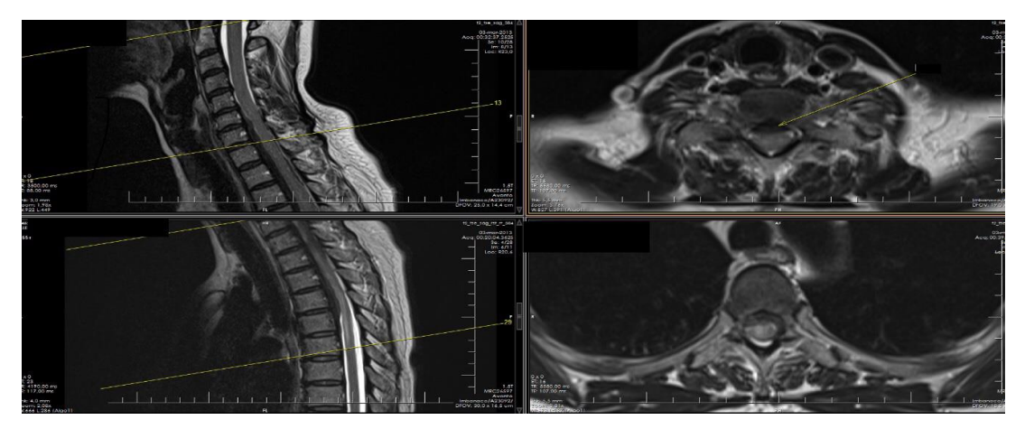
FIG. 1. Initial MRI (T2 weighted image) of Cervico-thoracic spine with extradural anterior mass with low signal intensity.

We present a 54-year-old woman that was brought to the emergency department due to 5-month history of cervical and upper-back pain. The main complaint was paresthesia and palsy of the four extremities. She had no history of infectious, tumoral or degenerative diseases; weight loss, night sweats or history of fever was also denied. She presented numbness of upper and lower limbs, weakness, gait disturbances, difficulty urinating and back pain that had increased to 8/10 on the visual analog scale (VAS) over the last 5 months. Physical exam revealed limited range of movement in neck, bilateral Babinski sign, generalized hyperreflexia and lower limb muscular strength of 3/5 on Daniels scale, grade 3 spasticity and decreased temperature perception. Magnetic resonance imaging (MRI) of the cervico-thoracic spine revealed mild compression of the cord with slight hypo-T1/hypo-T2 signal intensity from C6 to T8 surrounding the dural sac (FIG. 1). After gadolinium administration, a large irregular area of homogeneous contrast enhancement surrounding the cord at the ventral and dorsal periphery of the mentioned levels was seen (FIG. 2).