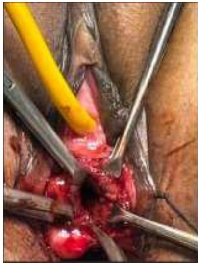
FIG. 3. Examination before Surgery.