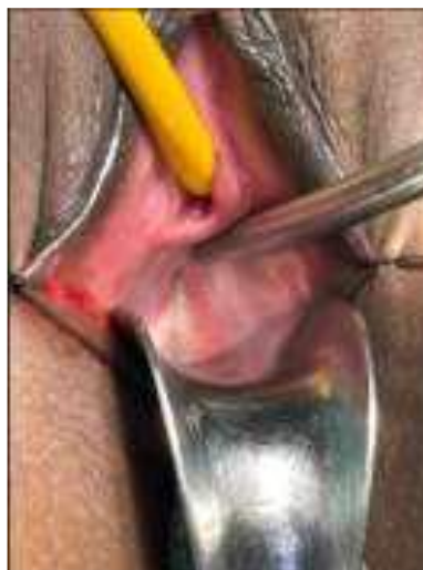
FIG. 2. Preoperative image showing blind small vaginal pouch with central dimple pointed by Hegars dilator.