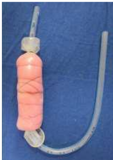
FIG. 4. Mould with drain.

Moulds used in postoperative period are commonly made with syringe or sponge or with a combination of both. In our case, as patient had significant hematometra and hematosalpinx along with hematoocolpos, we used a mould with drainage for gradual drainage of collected blood and debris, as we kept mould placed intraoperatively for 3 days in postoperative period before changing it. Mould we used to be made with a 20 cc syringe (plunger removed) with its anterior nozzle and cover being cut to make an opening to accommodate rubber drain of good calibre (28 FG abdominal drain). Drain was placed through this opening made, following this, a foam approx. 1.5 cm thickness (squeezeable) was wrapped over syringe (covering both ends of syringe) and fixed with suture. Then two condoms were placed over this and tied with suture to rubber drain at both anterior and posterior ends. Condom tip covering anterior end of drain was incised and condom was retracted to ensure free drainage through patent holes (FIG. 4).