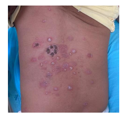
FIG. 1a. Lesions on the back showing erythematous plaques with erosions and multiple pus-filled vesicles showing hypopyon sign.

Bullous impetigo is a superficial cutaneous infection, caused by S. aureus [1]. 'Hypopyon' sign is seen in pus-filled flaccid bullae in upright position. It is also seen in immunobullous disorders [2].