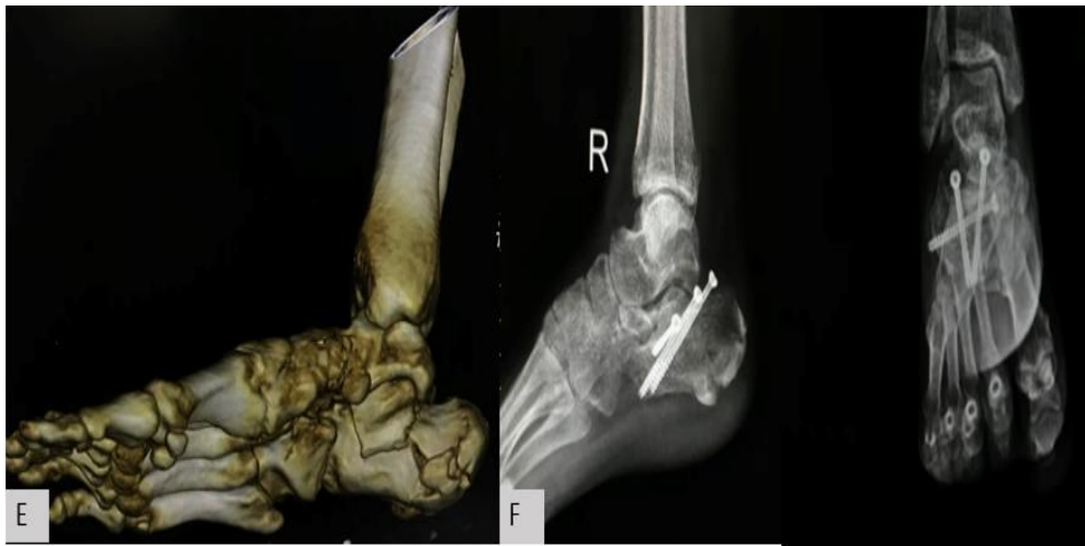
FIG. 3. E. 3-D VRT image revealing the comminuted nature of calcaneal fracture with intra-articular extension. F. Follow up post operative x-ray lateral and AP view of ankle showing well reduced fracture with metallic implants seen insitu .