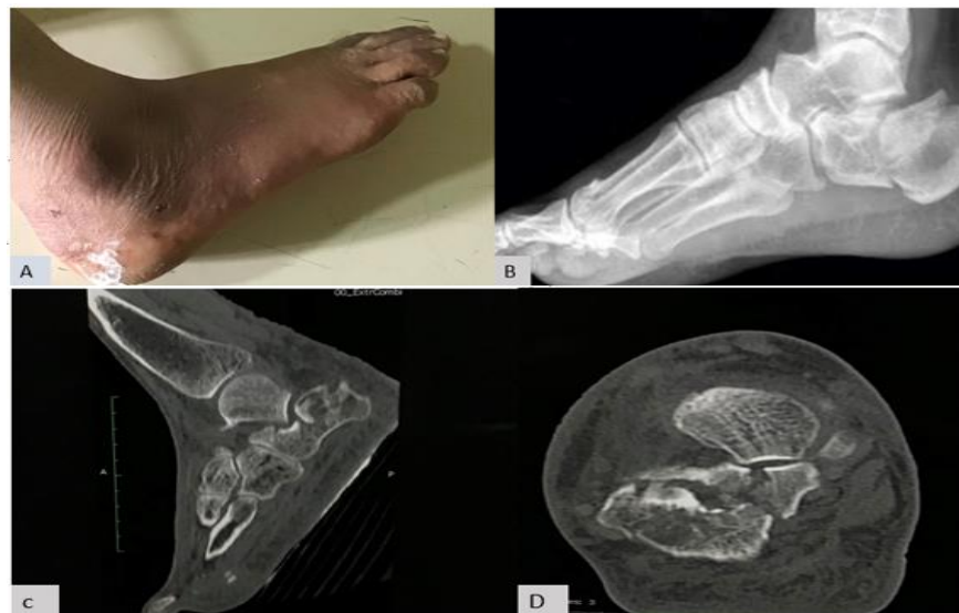
FIG. 2. A. Image depicting the Swelling of ankle. B. X-ray lateral view depicting the fracture of the Calcaneum. C/D. Saggital and Axial Images revealing the comminuted fracture of the Calcaneum with intra-articular extension.

38-year-lady presented with history of fall from height.