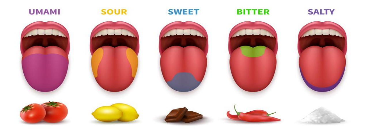
FIG. 2. The classic taste regions on the tongue [17,18].

These afferent fibers synapse in the medulla>thalamus>gustatory cortex in peripheral lobes and fibers to the hypothalamus in the limbic system. The figure below (FIG. 2) shows the classic taste regions of the tongue.