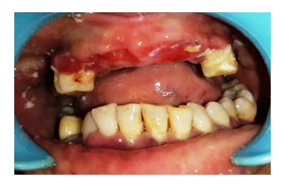
FIG. 1. Clinical picture of the patient with aggressive periodontitis with established Crohn's disease.

Orthopantomograph (OPG) of the patient revealed a severe generalized bone loss indicative of an aggressive periodontitis with few missing teeth in both the arches. Extraction of all the poor prognosis teeth with grade III mobility followed by implant placement was the line of treatment decided. The probability of peri-implant disease and its evidence was discussed with the patient.