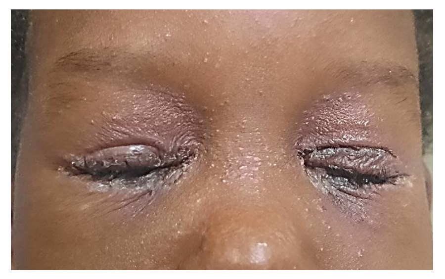
FIG. 3. Acute atopic eczema of the eyelids.