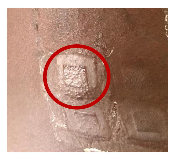
FIG. 6. Nickel patch test positivity.