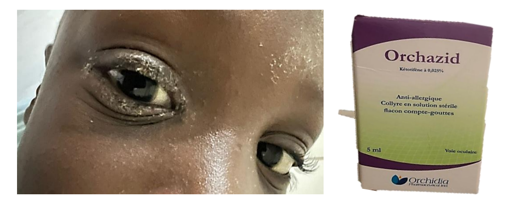
FIG. 4. Acute eczema of the eyelids with ketotifen eye drops.